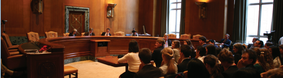
Lincoln Constitution Team in Washington, D.C.