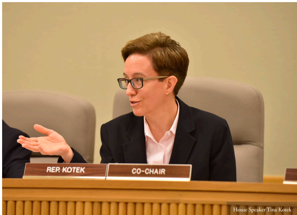
House Speaker Tina Korek

Summary: Requires cities of more than 1,000 in the Portland metropolitan area and those of more than 25,000 in the rest of the state to allow up to fourplexes in single-family neighborhoods. Cities between 10,000 and 25,000 will have to at least allow duplexes.