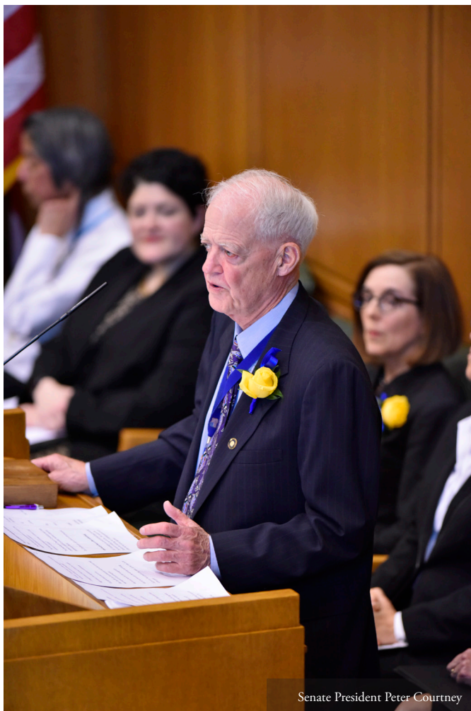
Senate President Peter Courtney

Victories for housing advocates spanned the entirety of session, with the passage of two first-in-the-nation policies sandwiching the 2019 Legislative Session: statewide rent control (SB 608) was one of the first substantive policies moved this session, and the elimination of single-family zoning (HB 2001) was passed with hours to spare on the final day of session. In addition, Housing advocates secured a historic investment of $336.5 million: $70.5M to addressing and preventing homelessness, $206.5 million for increasing the supply of affordable housing, $5 million for accelerating housing development, and $54.5 million for permanent supportive housing. The Housing and Community Services Department, which oversees these investments, has dramatically increased staff to accomplish the necessary work of engaging with stakeholders in the implementation and rollout of these funds.