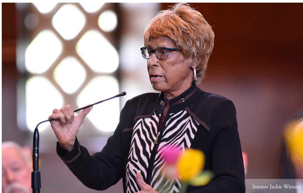
Senator Jackie Winters

Less than two weeks prior to the constitutionally required Sine Die, news spread that Republicans were threatening the "nuclear option" of a walkout once again. Earlier concerns that any negotiations with Senate Republicans would set a pattern of denying quorum came to fruition as the same Senators fled a second time. This walkout focused on their staunch opposition to HB 2020, a cap and invest policy which became known as the "carbon bill." The legislation would have capped emissions to move Oregon closer to previously set climate goals, but Republicans argued the costs associated with the program would harm rural businesses. The issue rose to the national media stage