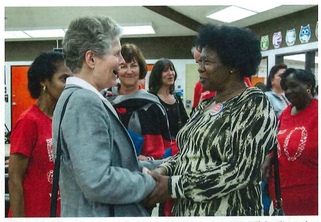
PPS Head Start celebrated our 50th birthday on May 19th, 2015. Over 500 staff, families and community partners joined our celebration at our Clarendon site.